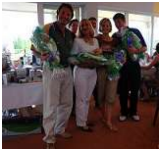
The team that came third!