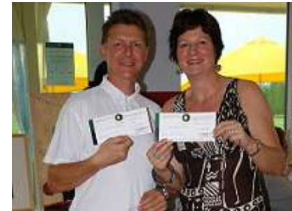
Winners of the “Longest Drive” and “Nearest to the Pin”.