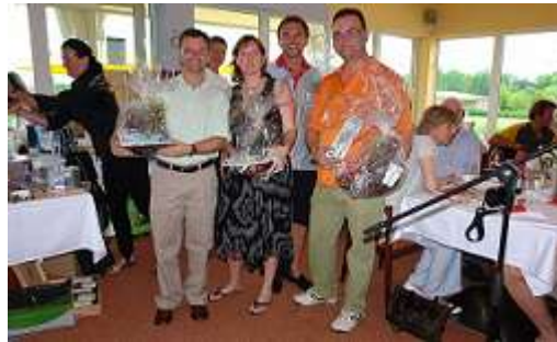
The team that came second!