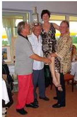
The team that came first!